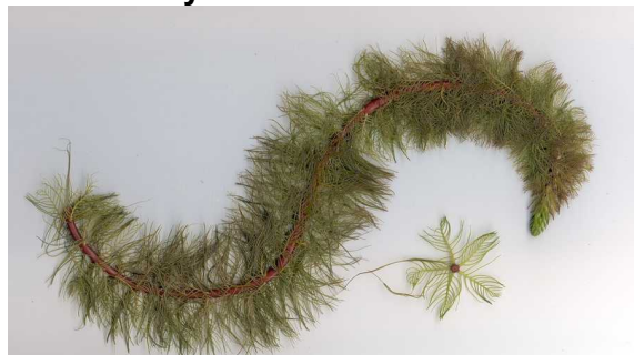
Variable milfoil stem and cross section

Pawtuckaway Lake empties into the Lamprey River in Nottingham. Problems in the lake can easily become problems in the river. Variable milfoil is one of those potential problems; it grows and spreads quickly. Left unchecked, it can overtake a body of water, ruining its water quality and recreational appeal. In 2014, variable milfoil plants were found in the lake.