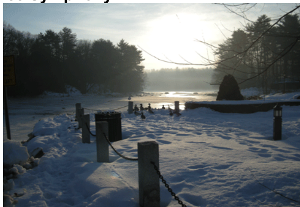
Chilly Schanda Park in Newmarket

Most of the 49-mile Lamprey River is freshwater, but the 2-mile section from Macallen Dam in Newmarket out to Great Bay is saltwater. Twice a day, this water rises and falls with the tides. This rhythm occurs even with a covering of ice. As ice expands with the incoming tide and constricts with the outgoing tide, it cracks and contorts. The action does not happen silently. The sound waves travel through air and water as usual, but they are distorted when they travel through ice. The result is a