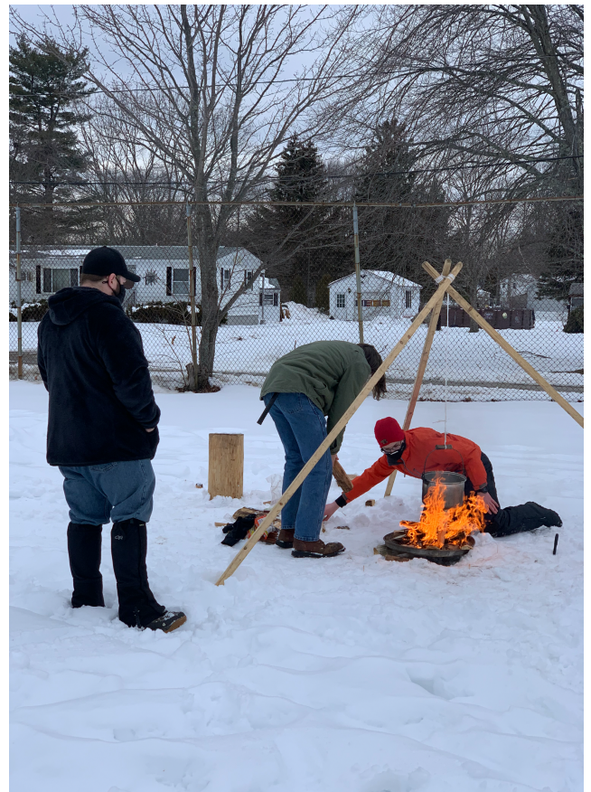
Feb. 15 th Troop Meeting: Fire Building Skills

Scout Troop 136 has resumed Troop Meetings at the American Legion on Sundays. These in person meetings will be outdoors until Covid-19 improves. Scouts continue their outdoor meetings, learning knot tying, fire building and other outdoor skills. No camping is currently scheduled for the upcoming months. Several Scouts are working on having their Scout projects approved and are planning to soon start their projects. The Scouts will be attending the annual Klondike Derby at Raymond Sportsman's Club being held on March 6 th .